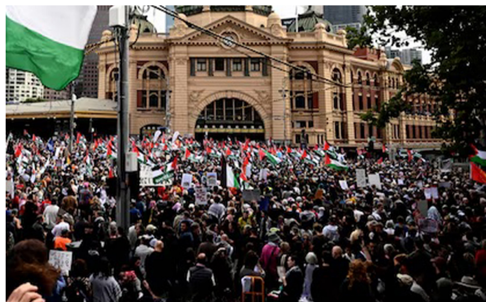
An anti-Israel demonstration is staged in Australia.

The relevant and interested parties in the region would be well advised to correctly grasp the nature of the offenders who chose aggression and war under the pretext of fake peace, and to fulfil their due responsibility in switching the trend in the situation of the Middle East back to peace and stability.