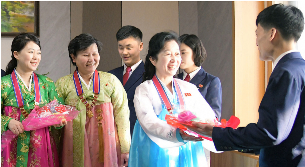
Korean women lead a worthwhile life.