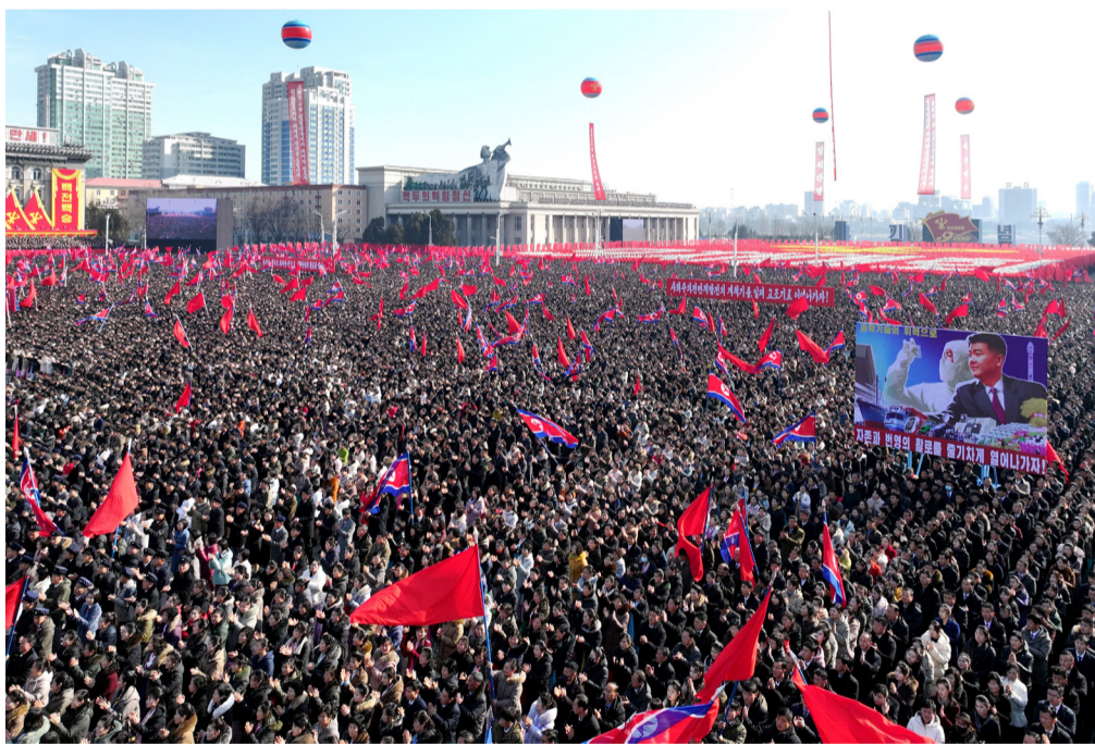
A Pyongyang municipal military-civilian meeting and public procession for implementing the decisions of the Ninth Congress of the Workers' Party of Korea take place with splendour at Kim Il Sung Square on February 27.