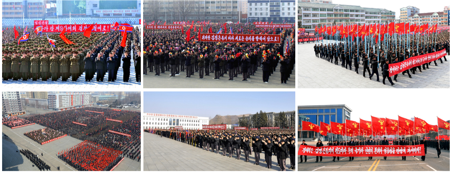
Military-civilian meetings take place in South Phyongan, North Hwanghae, Jagang, South Hamgyong and Ryanggang provinces and Rason Municipality on March 4 to vow to implement the decisions of the Ninth Congress of the Workers' Party of Korea.

The marchers passed through the squares and streets, shouting revolutionary slogans.