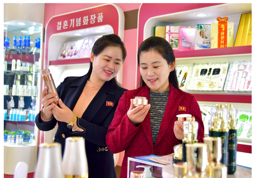
The cosmetics developed by the Pyongyang Cosmetics Factory are popular among women.

The product was highly appreciated at the national cosmetics exhibition, the light industrial goods exhibition Development of Light Industry-2025 and others.