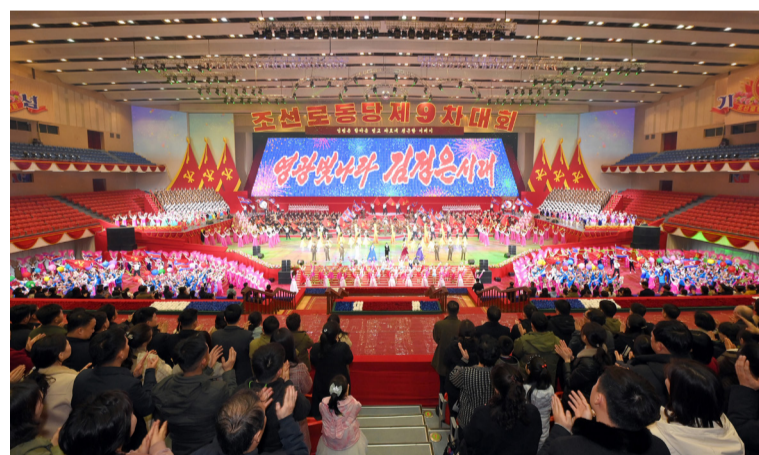
The audience gives a standing ovation at the end of the grand art performance in commemoration of the Ninth Congress of the Workers' Party of Korea.