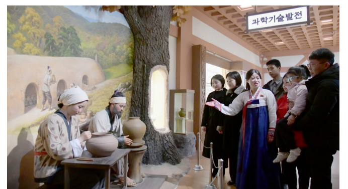
Working people and schoolchildren enjoy the first full moon day with folk games and a visit to the Rangnang Museum.